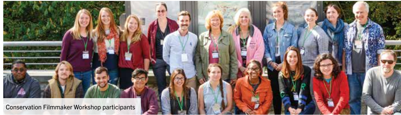
Conservation Filmmaker Workshop participants