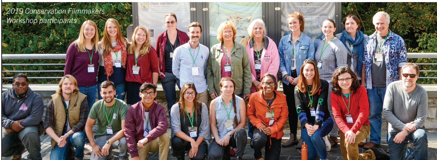
2019 Conservation Filmmakers Workshop participants

FREE ACCESS to dozens of entertaining and informative films and conversations about our world, from around the world.