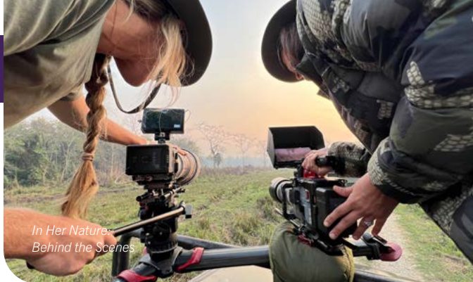
In Her Nature: Behind the Scenes