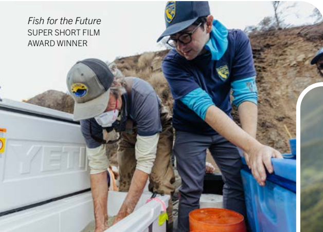
Fish for the Future SUPER SHORT FILM AWARD WINNER