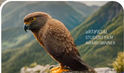
aRTIFICiAL STUDENT FILM AWARD WINNER